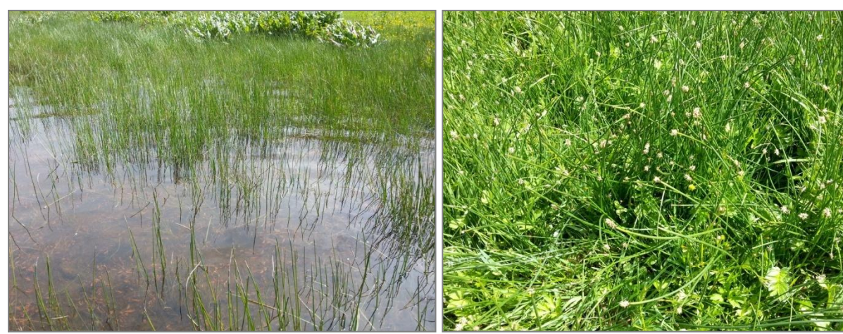
NTSV14_Photo_543_7_JM_01a.jpg NTSV14_Photo_005_7_JM_01a.jpg 7 Eleocharis palustris – Ranunculus flammula community