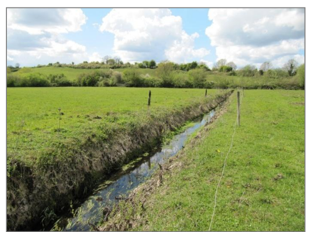
NTSV14_Photo_022_17_FON_01a.jpg 17 Drains