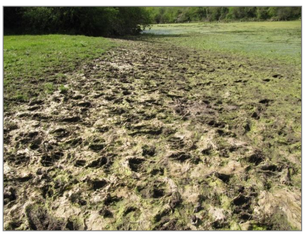
NTSV14_Photo_021_22_FON_01a.jpg 22 Evidence of ecologically unsuitable grazing