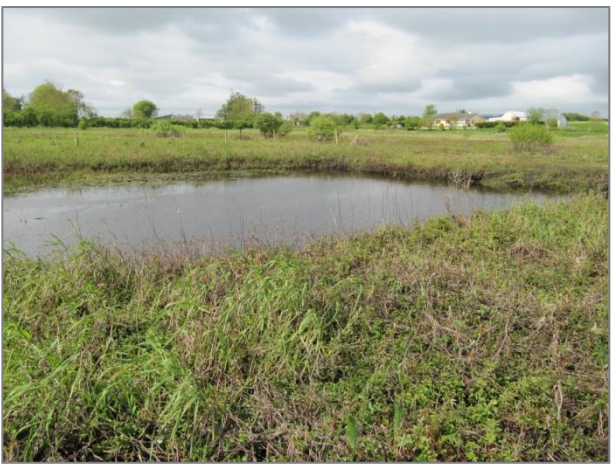
NTSV14_Photo_207_16a_FON_01a.jpg 16 Permanent/Open water