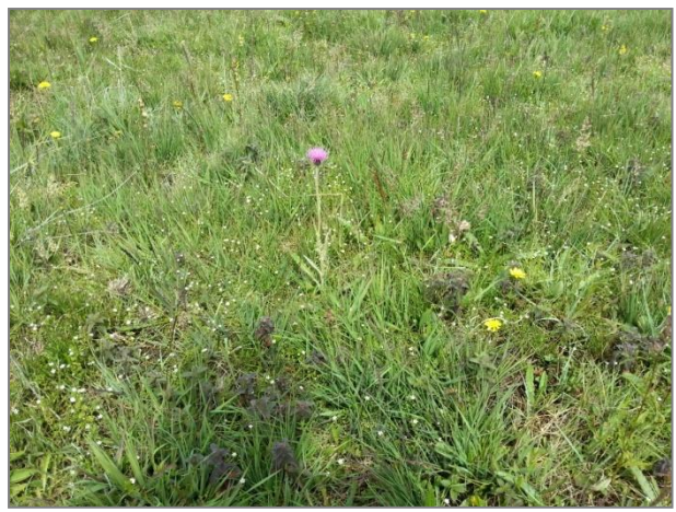
NTSV14_Photo_095_9_JM_01a.jpg 9 Molinia caerulea – Carex panicea community