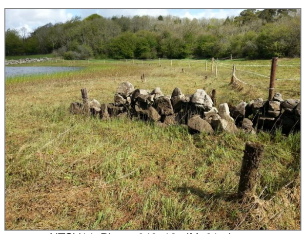
NTSV14_Photo_040_18_JM_01a.jpg 18 Discontinued hedges/walls