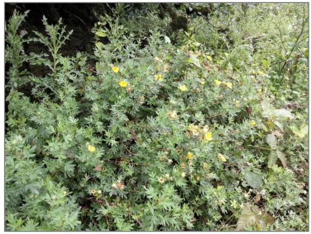
NTSV14_Photo_009_131_JM_01a.jpg 13.1 Potentilla fruticosa