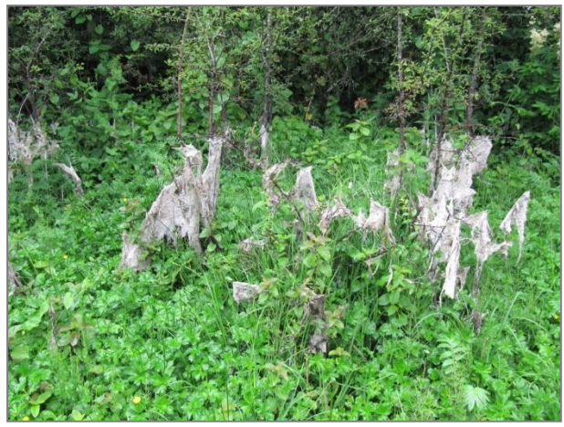
NTSV14_Photo_560_20_FON_01a.jpg 20 Algal paper