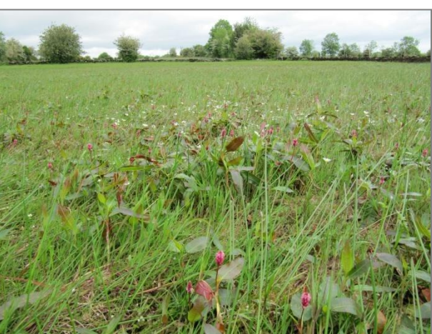
NTSV14_Photo_302_8_FON_01a.jpg 8 Polygonum amphibium community