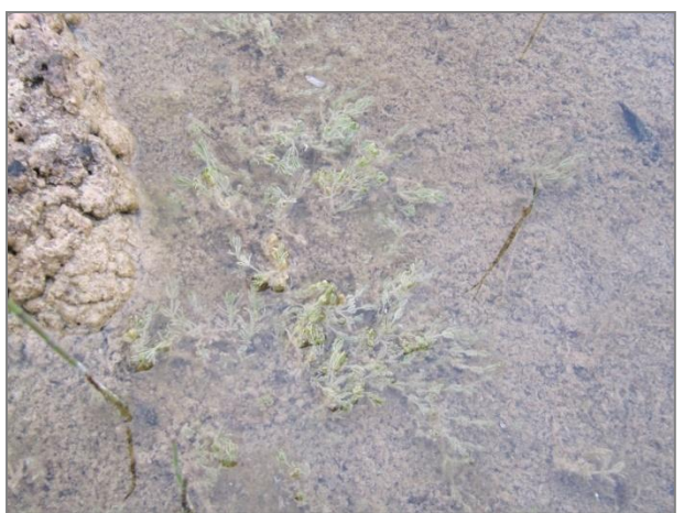
NTSV14_Photo_293_12_FON_01a.jpg 12 Charophyte community