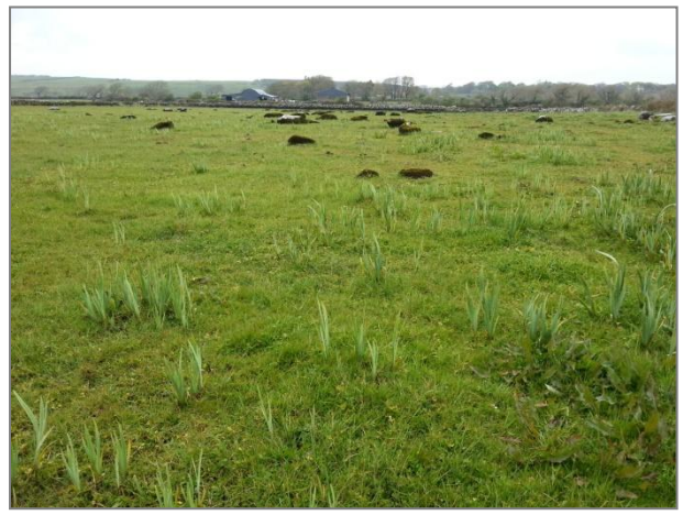
NTSV14_Photo_004_10_JM_01a 10 Grass/forb-dominated community