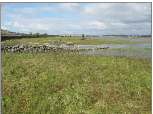
NTSV14_Photo_019_18_FON_01a.jpg 18 Discontinued hedges/walls