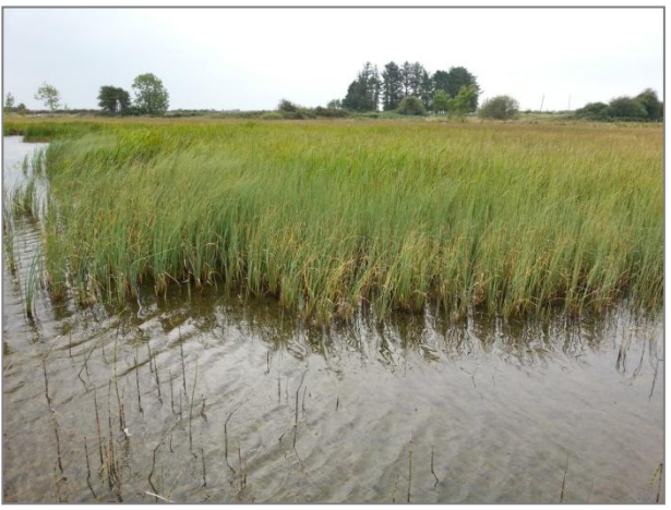
NTSV14_332_11_JM_01a.jpg 11 Aquatic macrophyte community