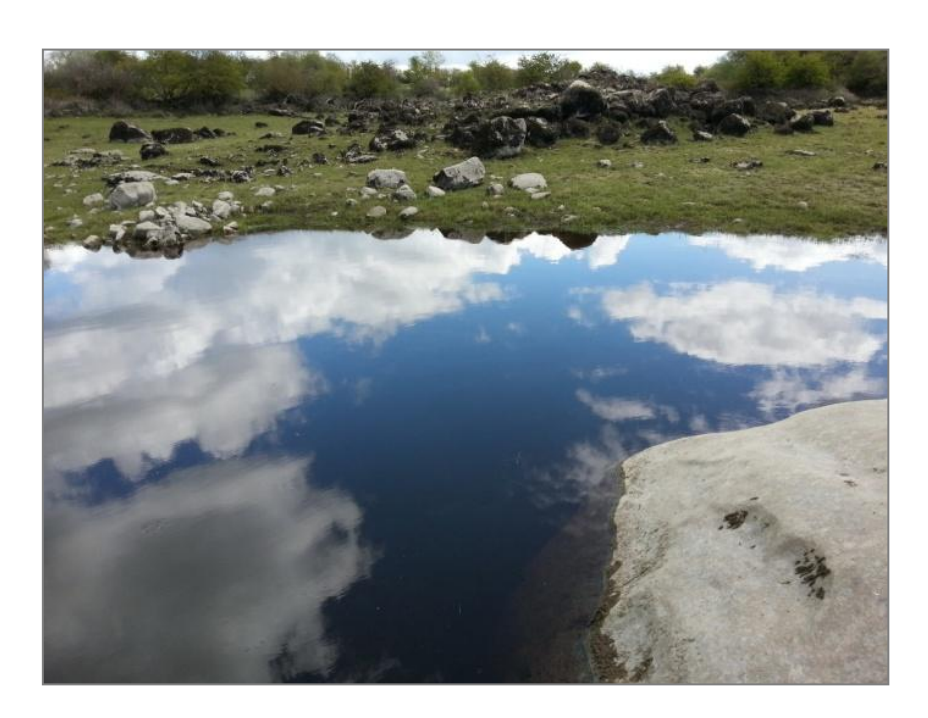
Overview of partially flooded turlough at Site 23 Drumcaran 3/Loughvella, Co. Clare.