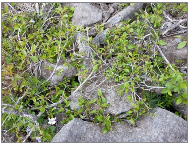
NTSV14_Photo_017_132_JM_01a.jpg 13.2 Frangula alnus