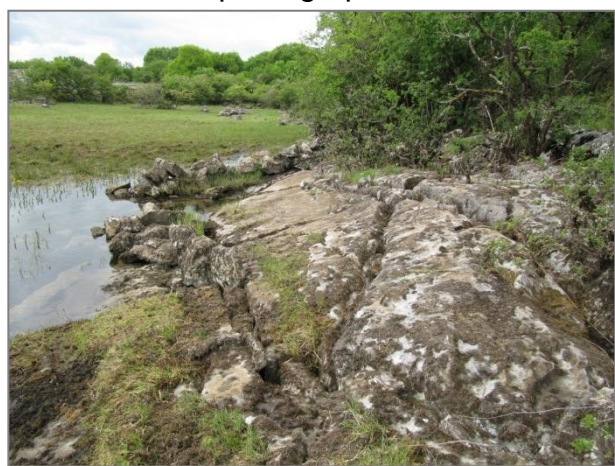
NTSV14_Photo_018_2_FON_01a.jpg 2 Flooded pavement