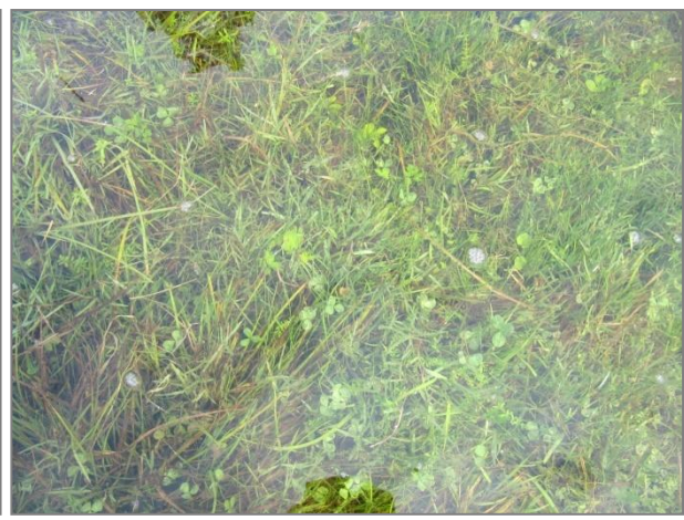
NTSV14_Photo_090_10_FON_01.jpg 10 Grass/forb-dominated community