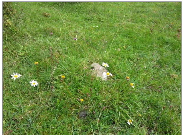
NTSV14_Photo_251_1_JM_01a.jpg 1 Limestone grassland