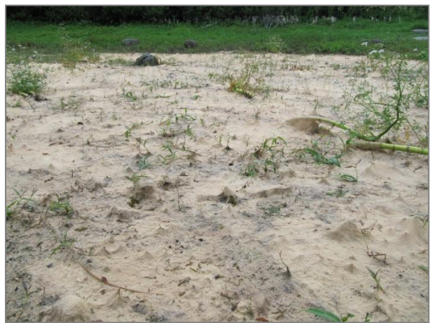
NTSV14_Photo_560_21_FON_01a.jpg 21 Evidence of nutrient enrichment