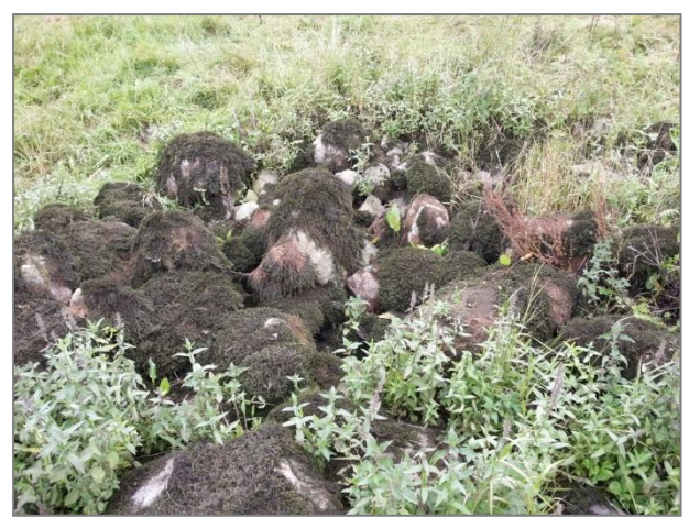
NTSV14_Photo_037_15_JM_01a.jpg 15 Swallow/sink holes