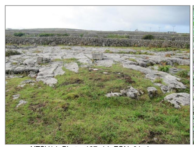
NTSV14_Photo_197_14_FON_01a.jpg 14 Limestone pavement within 100m