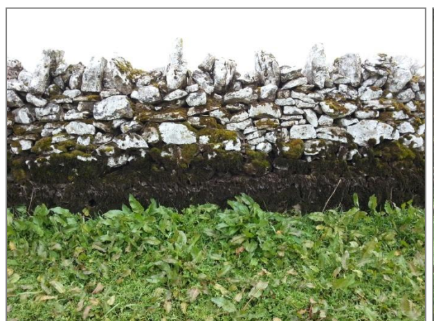
NTSV14_Photo_004_136_JM_01a.jpg NTSV14_ 13.6 Cinclidotus fontinaloides