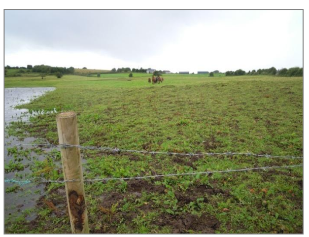
NTSV14_Photo_385_22_DD_01a.jpg 22 Evidence of ecologically unsuitable grazing