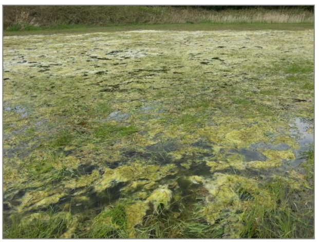
NTSV14_Photo_531_21_JM_01a.jpg 21 Evidence of nutrient enrichment