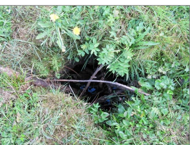
NTSV14_Photo_022_15_FON_01a.jpg 15 Swallow/sink holes