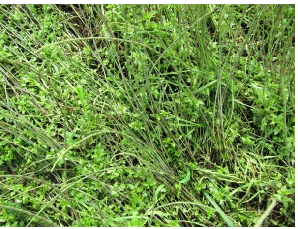
NTSV14_Photo_207_121_FON_01a.jpg 12.1 Other community