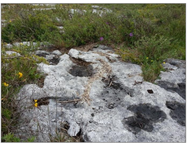
NTSV14_Photo_019_19_JM_01a.jpg 19 Strandline